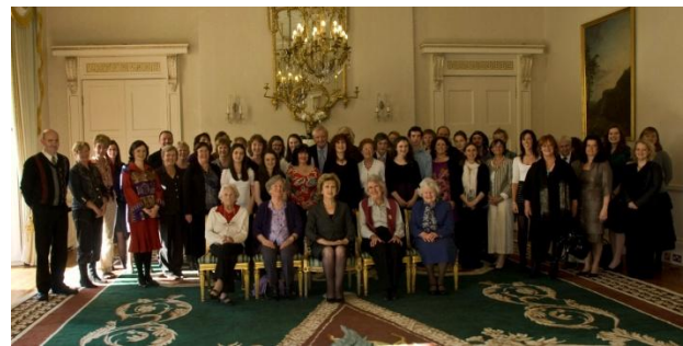
Wednesday October 20 th 2010, Áras an Uachtaráin Harpers and supporters of Cairde na Cruite from the four corners of Ireland standing in honour of President Mary McAleese and founder members of Cairde na Cruite to mark its 50 th anniversary celebrations.