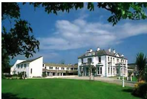
The Venue: An Grianán, Termonfeckin, Co. Louth

The annual Cúirt Chruitreachta in An Grianán, Termonfeckin, Co. Louth now ranks among the top international harp festivals. It focuses primarily on the music of the ancient harping tradition and Irish traditional music and attracts students from all over the world. This challenging week long programme of workshops, concerts, sessions and tuition offers an opportunity to gain a better understanding of Irish music, song and dance as well as developing the skills and repertoire for players of all standards.