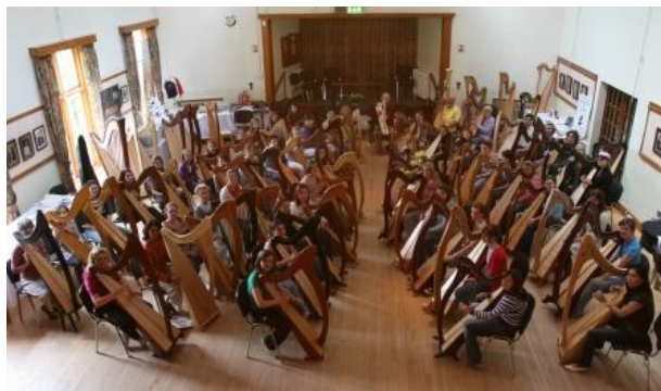
Harpers at Cairde na Cruite's annual residential summerschool An Chúirt Chruitreachta, An Grianán, Termonfeckin, Co. Louth